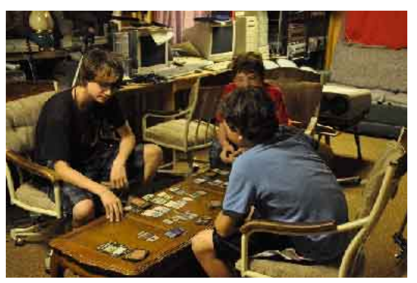
SPRING BOARDS AND SWIMMING

Much is expected from the future studies of this mystical merchant of mayhem. If we can cast one good word of advice, it is this: it is soon expected that this specimen will mate, and when it does, we must be there and we must be ready to observe the miracle. On your toes, gentlemen, on your toes.