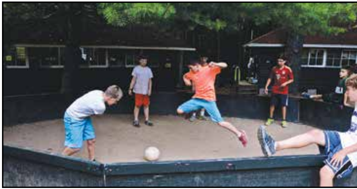
Ability to dodge the ball is a key attribute of a good Gaga player, as is the ability to recover from the notorious Gaga knuckles.