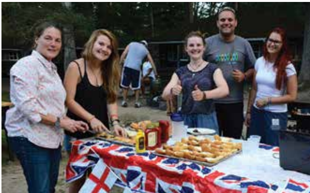
Shohola's English contingent shows off its food, which included scones and apple crumble, during International Food Night.