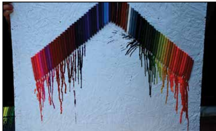
Students in a new class called Dynamic Art glued crayons to a background and then melted the crayons, creating a design.