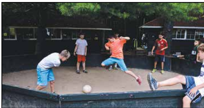
Ability to dodge the ball is a key attribute of a good Gaga player, as is the ability to recover from the notorious Gaga knuckles.